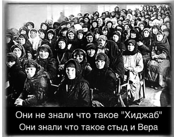
Meme 11. North Caucasian Women, 1900s.

Conservative hijab is not a foreign concept for many Muslims but depending on the style some leaders of Muslim nations fear its revival. The Chechen Republic uses an elimination strategy against Wahhabism, which is associated negatively in the Caucasus region with all-black hijab and face-veils like Niqab. The fear is that a foreign, radical form of Islam will engulf the entire society and encourage the youth to join extremist groups. However, hijab is enforced socially in Chechnya, but it is limited to styles personifying Chechen heritage. [19] There are reports of Chechen men firing paintballs at younger women who are not fully covered, and some women find marriage without full-hijab difficult. [20] , [21] The concept is to foster Islam and piety among the population while maintaining cultural identity and fighting an ongoing twenty-year insurgency.