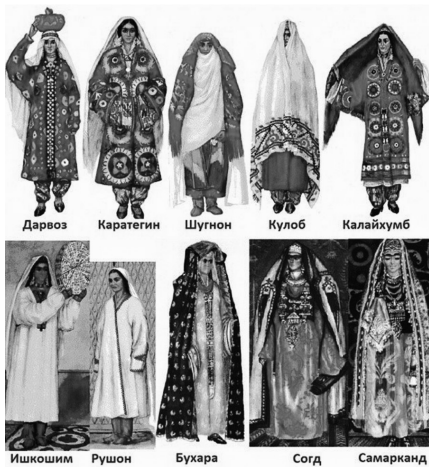
Image 2. Traditional Tajik hijab, 2018.

Contrary to Chechnya and Turkey’s approach, other nation-states are taking counter-radicalization strategies that ban certain types of hijab. In Tajikistan, hijab trends like black Burqa deviate from traditional Tajik culture, as depicted in Image 2 , [26] and authorities are reportedly banning the sale of Burqa in markets and barring it from public spaces. [27], [28] The State Islamic University in Indonesia, home to the world’s largest Muslim population, banned Burqa in 2018 due to the concern of extremist propagation. [29] Similarly, in European countries like France, Denmark, and the Netherlands, Burqa is viewed as dangerously close to terrorism, which resulted in these Western countries banning face-covering hijab