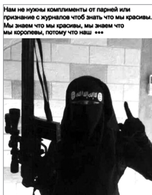
Meme 3. Russian Language, 2015.

In jihadi content, hijab should not reveal the shape of the body, and must be in the tradition of black to prevent jealousy from female and male onlookers. Hijab obliges women to seek approval from God, not man, and discourages false worshiping of material goods like make-up and unnatural beauty. Meme 3 translates from Russian as, “We don’t need compliments from boyfriends or recommendations from magazines to know we are pretty. We know that we are beautiful, we know that we are queens...”