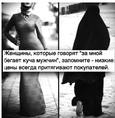
Meme 7. Russian Language, 2015.

In a rebuke against this trend, some users try to shame Muslim women through content like Meme 6 , “Recognize! You are a modest Muslim woman, in agreement for the sake and satisfaction of Allah / or a show-off, pleasing Satan, and who doesn’t know the point of the veil.” In Meme 7 , we see a woman wearing a fitted, full-length blue dress, ornate necklace, and a fitted headscarf. This is an example of current hijab fashion popular in Russia, in which the body and hair are covered, and the clothing is fitted and colorful. The creator of Meme 7 contrasts an image of a woman dressed in Niqab; the quote reads, “Women who say, ‘tons of men chase after me’, Remember—the lowest price always attracts the most buyers.”