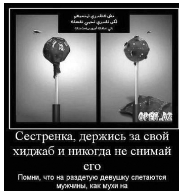
Meme 10. Russian Language, 2015.

never take it off. Remember that the undressed woman will fight off men like flies.”