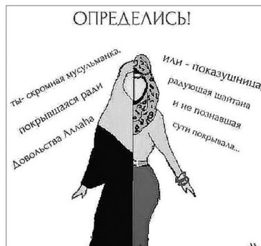
Meme 6. Russian Language, 2014.

defined by full length or three-quarter length overcoats, long skirts, loose-fitting tops, and a wrapped yet loose decorative headscarf. In Meme 8 , we see two women modeling Turkish hijab fashion contrasted with a woman in black Burqa. The quote reads, “In your opinion, who is wearing hijab???” The point here is that Turkish hijab fashion does not represent ‘true’ hijab.