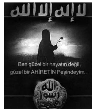
Meme 1. Turkish Language, 2018.

In the mainstream Muslim world, hijab is considered an Islamic duty and is not an extremist symbol in and of itself. Hijab manifests in many forms like the Chador, Khimar, Niqab, Burka or Al-Amira, [6] and contemporary hijab fashion integrates styles from European haute-couture to Urban streetwear. [7] There is a belief held by some Muslims that hijab can determine a woman's place in the afterlife because it protects her honor, family, and marriage. Since hijab is a valued standard and normal aspect of daily life in many Muslim societies, jihadi groups create content using hijab themes to attract women. The associated captions on memes are similar to Meme 1 translating from Turkish to English as: "I am not