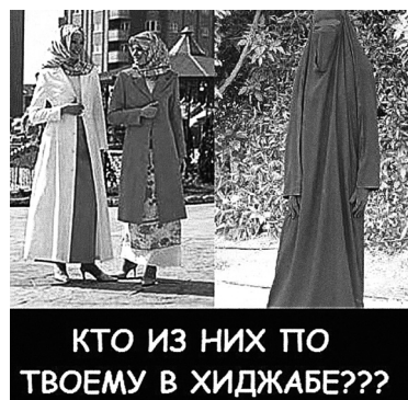
Meme 8. Russian Language, 2014.

Turkish fashion is popular among Muslim women throughout Eurasia, and there are many Russian-speaking Muslims in Turkey. Turkish hijab fashion can be very colorful and