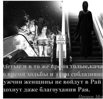
Meme 5. Russian Language, 2014.

In the jihadist view, women who choose not to wear hijab as prescribed go against God’s Law, and the content attempts to scare and shame women as illustrated in Meme 5 . A modernly clad woman with uncovered hair wearing a daisy-duke jean skirt and pink tank top descends via escalator to the fires of Hell. Meanwhile, the woman in a loose-fitting black hijab ascends to the bright light of Heaven. The Russian Cyrillic warns, “Dressed and at the same time naked, swaying while walking, and these tempting [actions] men and women will not go to Heaven and will not even breathe Heaven’s fragrance.” This references Hadith 1633 from the Book of the Prohibited Actions, but it has been abbreviated heavily. [10] , [11] The paraphrasing of the Qur’an and Hadith is common with extremist propaganda, [12] and the consequence is reshaping ideology by novice followers on social media. When quotes from religious texts are without context or translated liberally, it contributes to misinterpretations that are splintering mainstream Muslim society. [13]