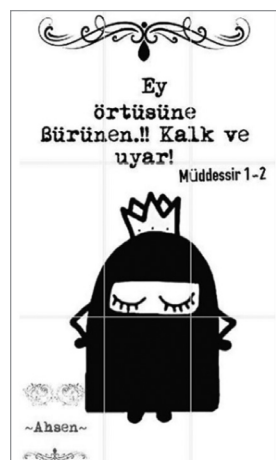
Meme 2. Turkish Language, 2018.

Extremist content urges Muslim women to cover themselves, and the Qur’an and the Hadith are used as the justification. Hijab memes created by IS supporters depict women in black Niqab with the eyes veiled or in Burqa which completely covers the face. Since the eyes are considered the windows to the soul, which can flirt and entice, guidance follows that either the eyes should be veiled or mostly covered. Exceptions may be made in combat situations. One of the more controversial aspects of hijab in jihadi circles is whether the face, including the eyes, should be covered. While most agree to cover the face, AQ-aligned groups hold a less strict rule on covering the eyes, as the crowned female Muslim cartoon in Niqab in Meme 2 , shows verse one and two from Al-Muddaththir, Surah 74, “O you who are cloaked!! Arise and warn!” [8], [9]