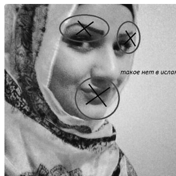
Meme 4. Russian Language, 2015.

should be covered by gloves as should the feet by closed-toe shoes and socks. Eye make-up is permitted, however, limited to black eyeliner in the tradition of the Sunnah. Although not encouraged, hair coloring is permitted if it resembles one’s original hue except black hair dye shouldn’t be too dark. A woman’s hair should be long without resembling a man’s cut. There are constraints on waxing facial hair and nail polish. Notably, plucking eyebrows and applying lipstick is taboo as Meme 4 streaks through penciled eyebrows and pink tinted lips, noting “this kind of thing does not exist in Islam.”